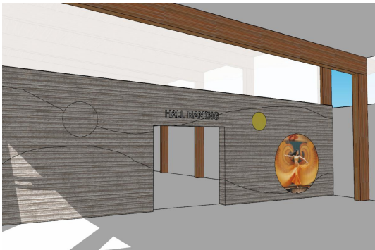
The Banquet Hall