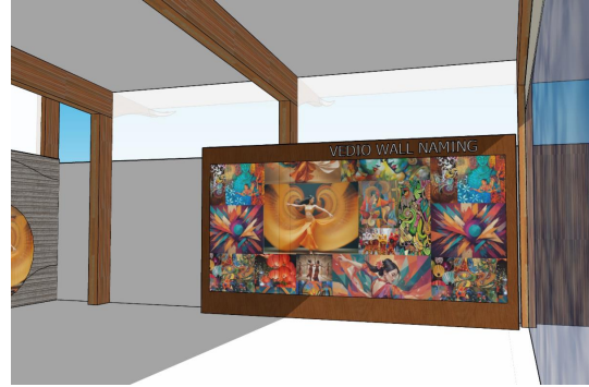
The Video WALL