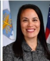
Gina Ortiz Jones