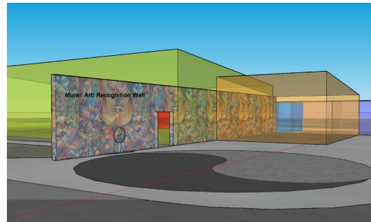
The Art Wall